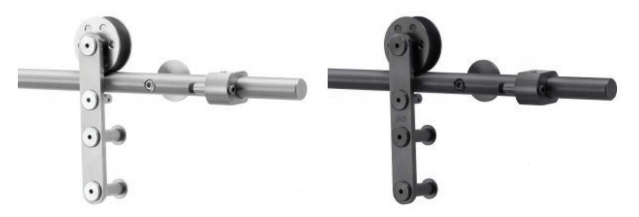
CRT-52-SS & CRT-52-BP Up to 175 lbs. [79 kg] per door